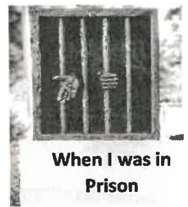
When I was in Prison