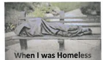
When I was Homeless