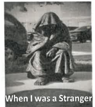
When I was a Stranger