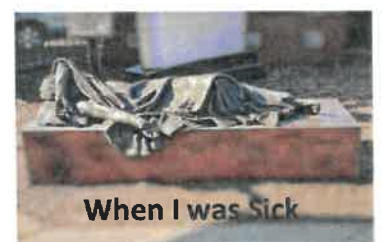
When I was Sick